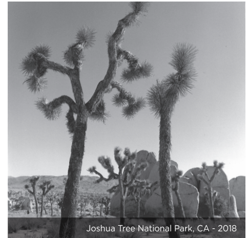
Joshua Tree National Park, CA - 2018

Mid-day transfer of group to Portland Airport and official end of guided tour.