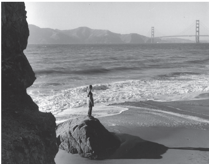
China Beach & the Golden Gate (Left), San Francisco Skyline Across the Bay - 2018

Spend an exciting 12 days exploring and photographing the diverse landscape, history and culture of the Pacific West Coast.