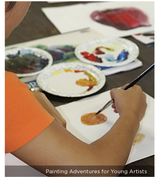
Painting Adventures for Young Artists

Members/WG Residents $115 • Non-members $135